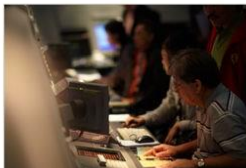
Area Air Traffic Control Officers (ATCOs).