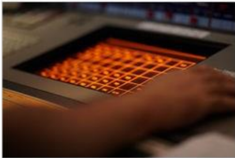
The Software Keyboard Display (SOKD) allows the ATCO to input information and communicate with the computer system based on touch inputs.

frequency or vice versa. The ATCOs can provide instructions to help aircrafts fly through or make a safe landing in Singapore smoothly and without interruption,” said Tan.