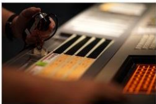
A Press To Talk (PTT) device is used when the controller needs to make a transmission on radio to an aircraft and the pilot.

landing or take-off. In this regard, there are equipment and crew stationed within the operations room dedicated specifically to avoid this. When the MPA is informed of vessels entering the Straits of Johor – the direction from which they are coming in, where the ships are heading and the size and height of these vessels – it relays the information to the ship crossing crew in SATCC. Buoys placed across the channel and a camera system zooming into the area enable the crew to confirm the location and size of these vessels. The data and recordings are then fed into the ship crossing system, where Flight Services Officers will process it and alert the ATCOs who are controlling the flights . Tan said that there is greater need for such services now that the vessels passing through the channel are much bigger and taller than before. He added that such ships, including barges, cranes, tankers and oil rigs, can go up to 180 metres high. “The main intent of this system is to verify the height of the vessel before it cuts across the aircraft’s glide path so that the vessel will not collide into an aircraft as the aircraft takes off or lands,” said Tan.