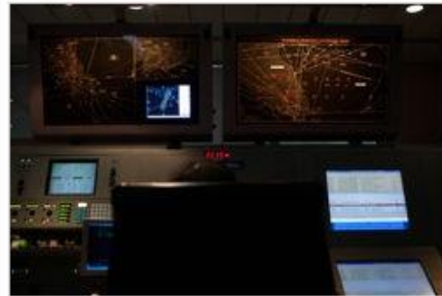
Consoles and radar screens used by the ATCOs at SATCC.