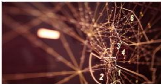
The Singapore Flight Information Region.