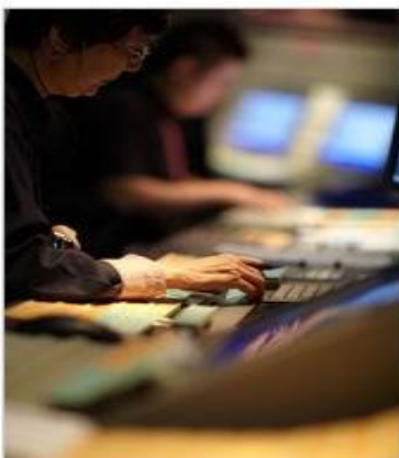
A dual working position is adopted at SATCC, where one ATCO uses radar and the other uses strips for the planning of air traffic.

The smooth communication between ATCOs and pilots, layers of backup available and cohesive coalition between departments and relevant players reveal that much effort is put into making ATC operations as smooth as possible. Tan believes that working together as a seamless chain of collaborating units will keep air traffic operations in Singapore’s airspace smooth and efficient. But more importantly, it ensures the safety of the aircraft and their passengers as they fly through or land and take-off from Singapore. He added: “At the end of the day, the safety of flights in the Singapore FIR is our top priority.”