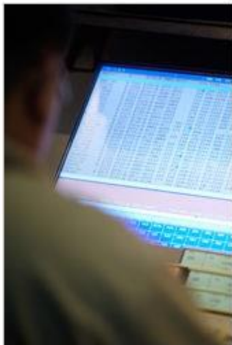
The flight page indicates both aircraft that are within Singapore's FIR as well as future in-coming flights and departures.